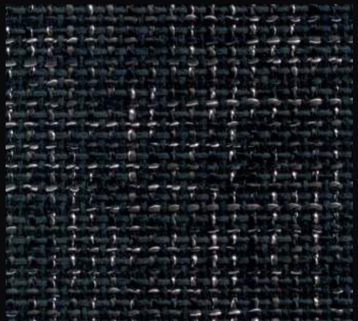
A6 - nero