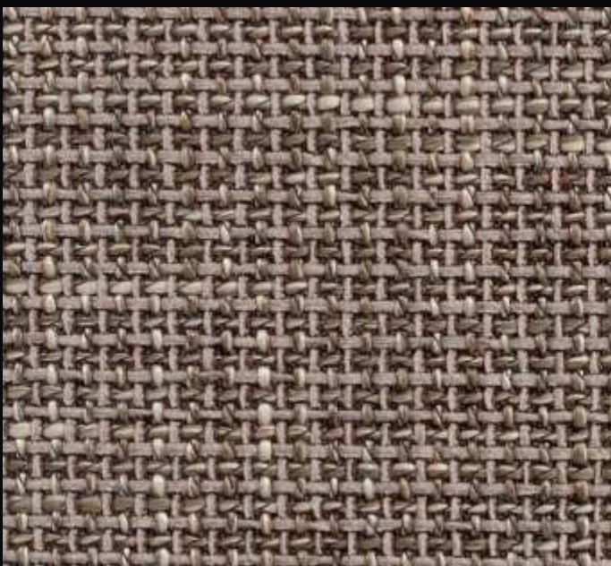
A5 - noisette