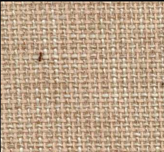
A3 - sand