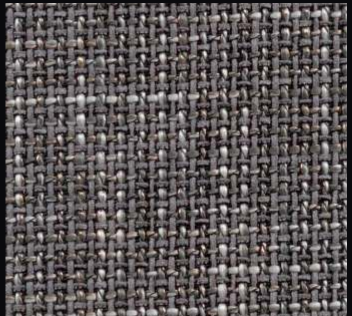
A4 - platin