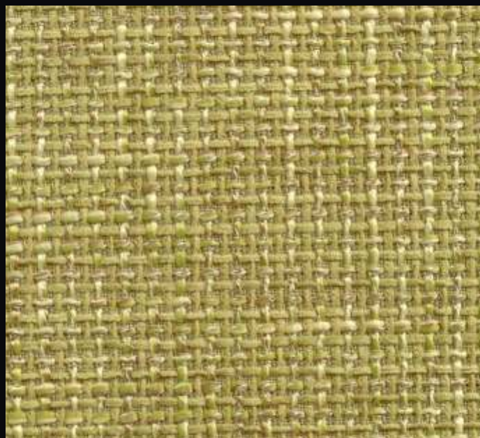
A8 - limette