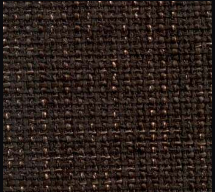
A2 - schoko