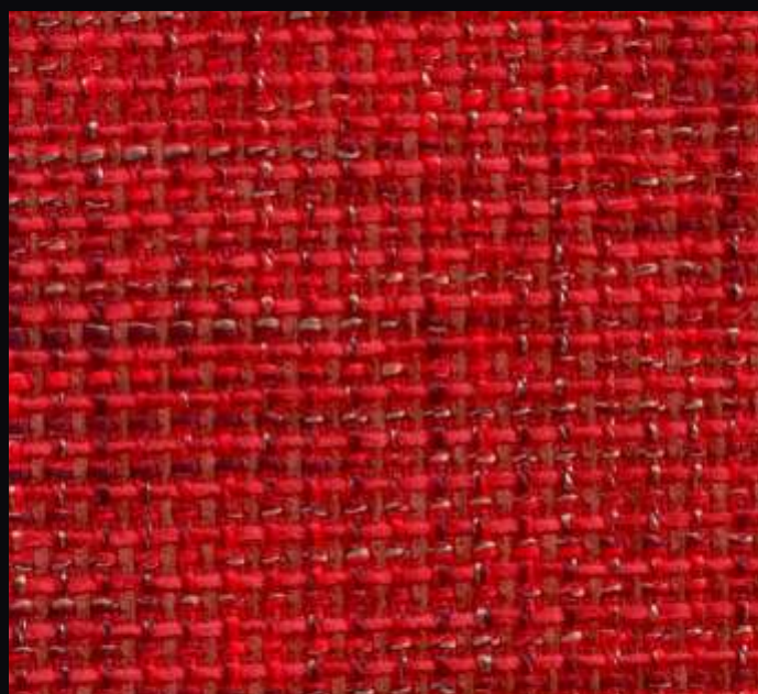
A10 - cherry