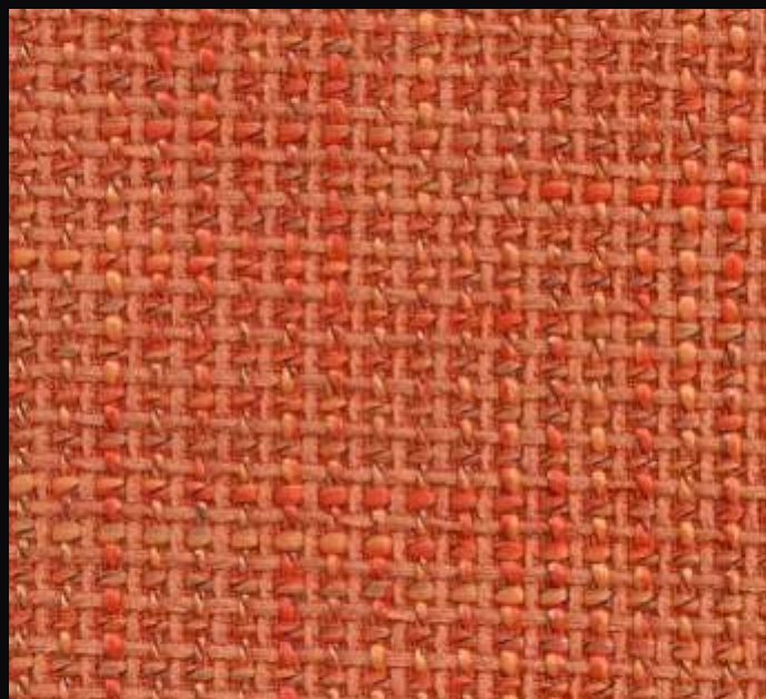
A7 - mandarine